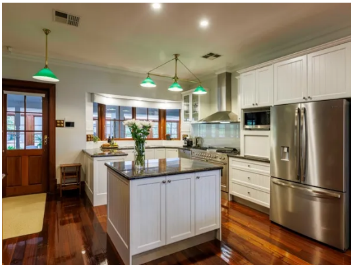
The bluestone homestead comes with a fully equipped kitchen.

The exceptional homesteads keep coming with Benbullen Retreat , a lush, manicured slice of Barossa Valley heaven about a 10-minute drive from busy Tanunda. Its genius Concierge Experience is a true blessing for those keen to sit back and let the good times roll as a personal assistant is on-call to book all your wining and dining reservations. They'll even arrange flowers from the best local florist if you need them.